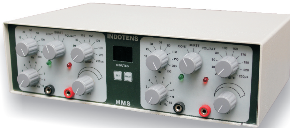
TABLE TOP DUAL CHANNEL TENS

INDOTENS is an advanced table top dual channel TENS. INDOTENS is a user friendly equipment with three out put modes continuous, burst and polarity alternation, independent controls for each channel.